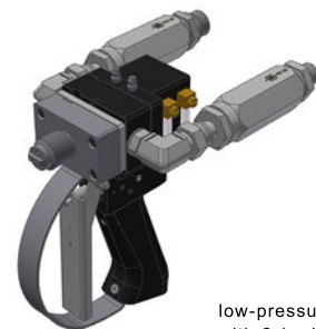
low-pressure version with 2:1 mixer holder