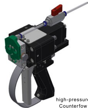
high-pressure version Counterflow injection with atomiser attachment