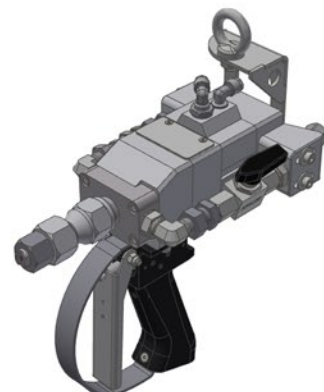
Special solution (low-pressure); Purging with A component